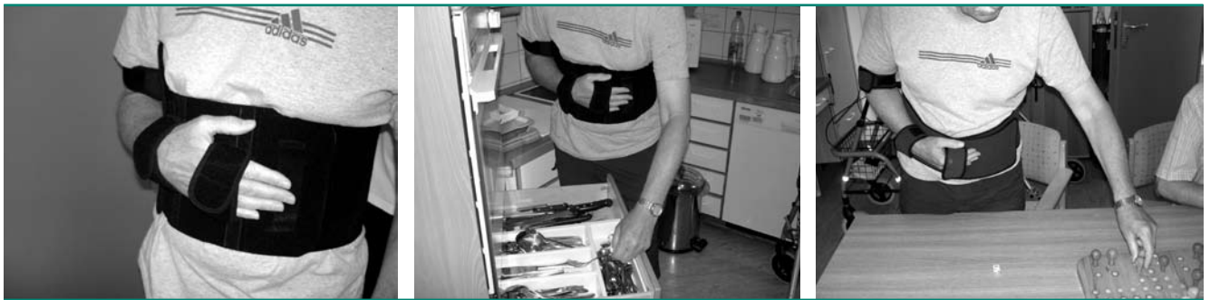
Fig. 1: Complete restriction of the healthy arm